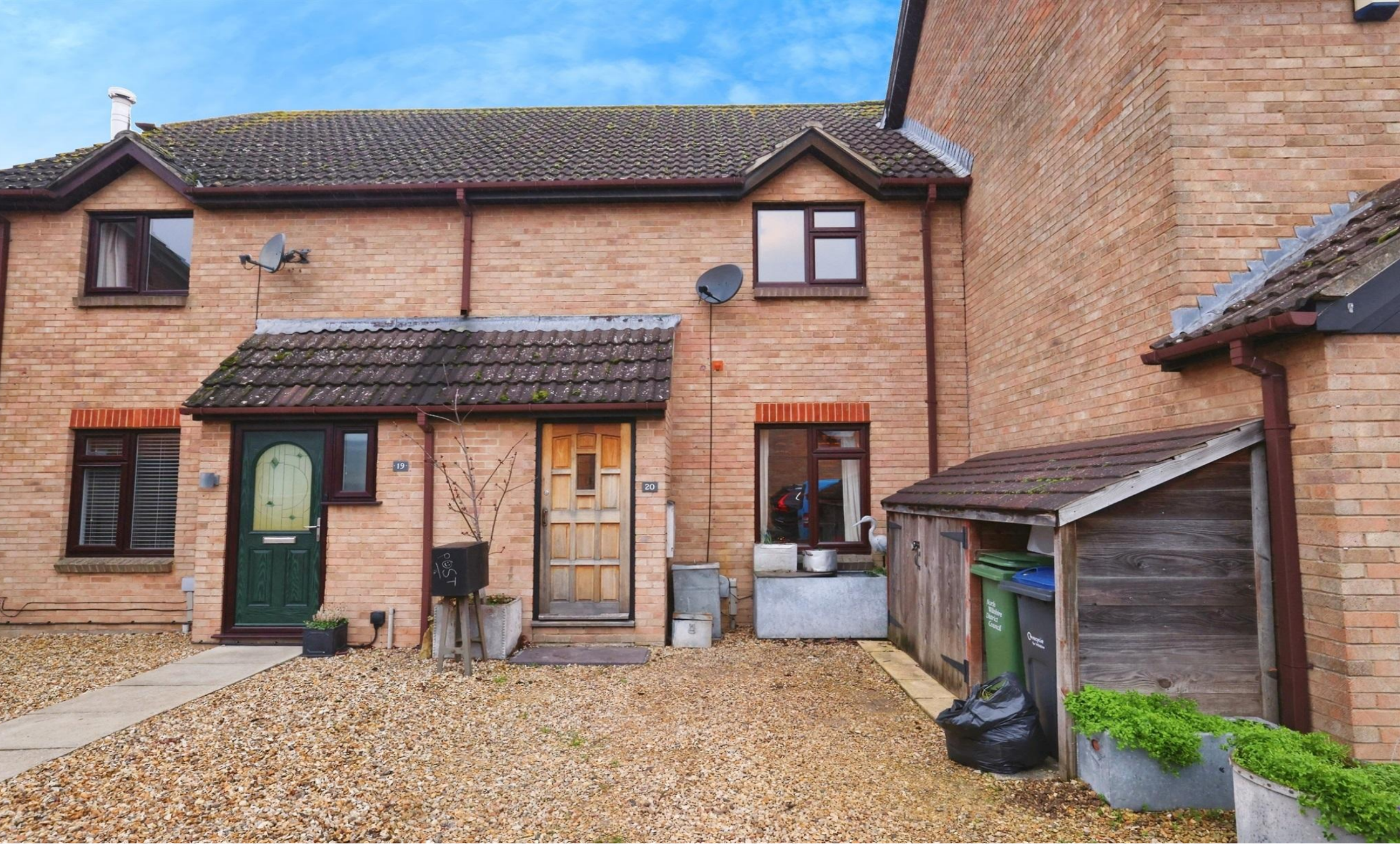
Guthrie Close, Calne SN11 9QA