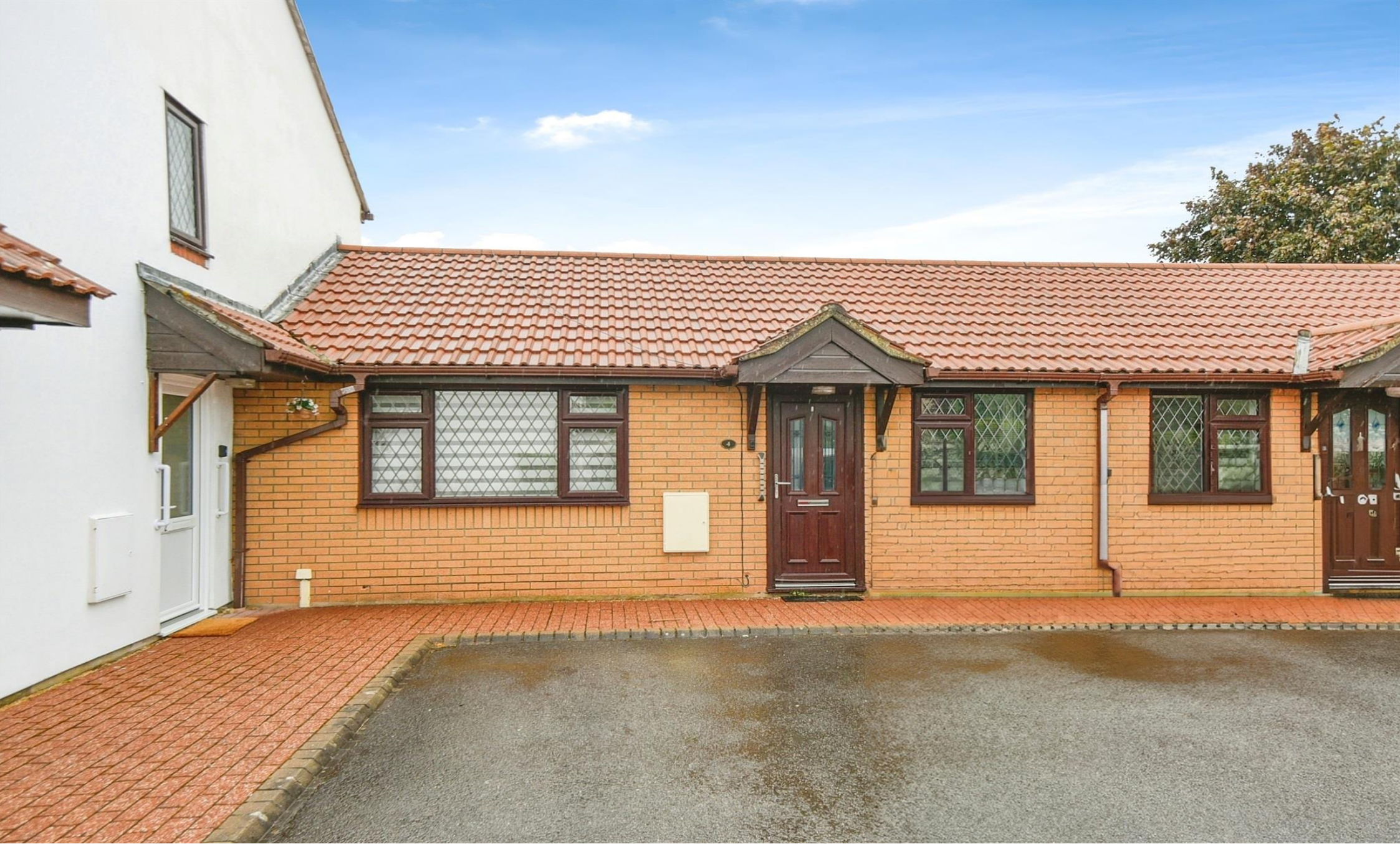
Cherry Tree Court, Calne SN11 9ES