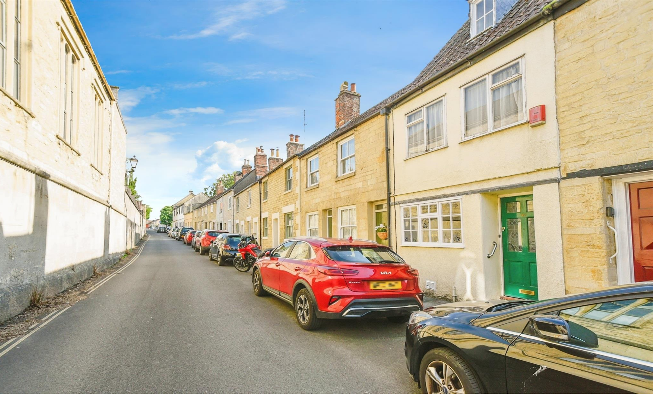
Church Street, Calne SN11 0HZ