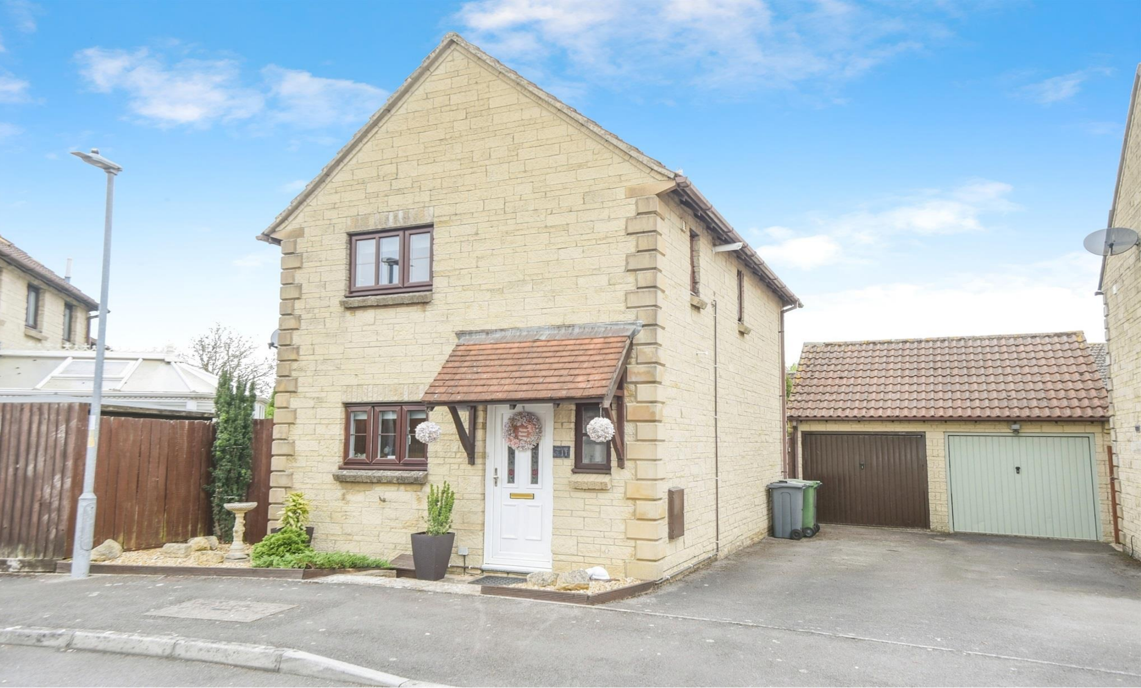
Magnolia Rise, Calne SN11 0QL