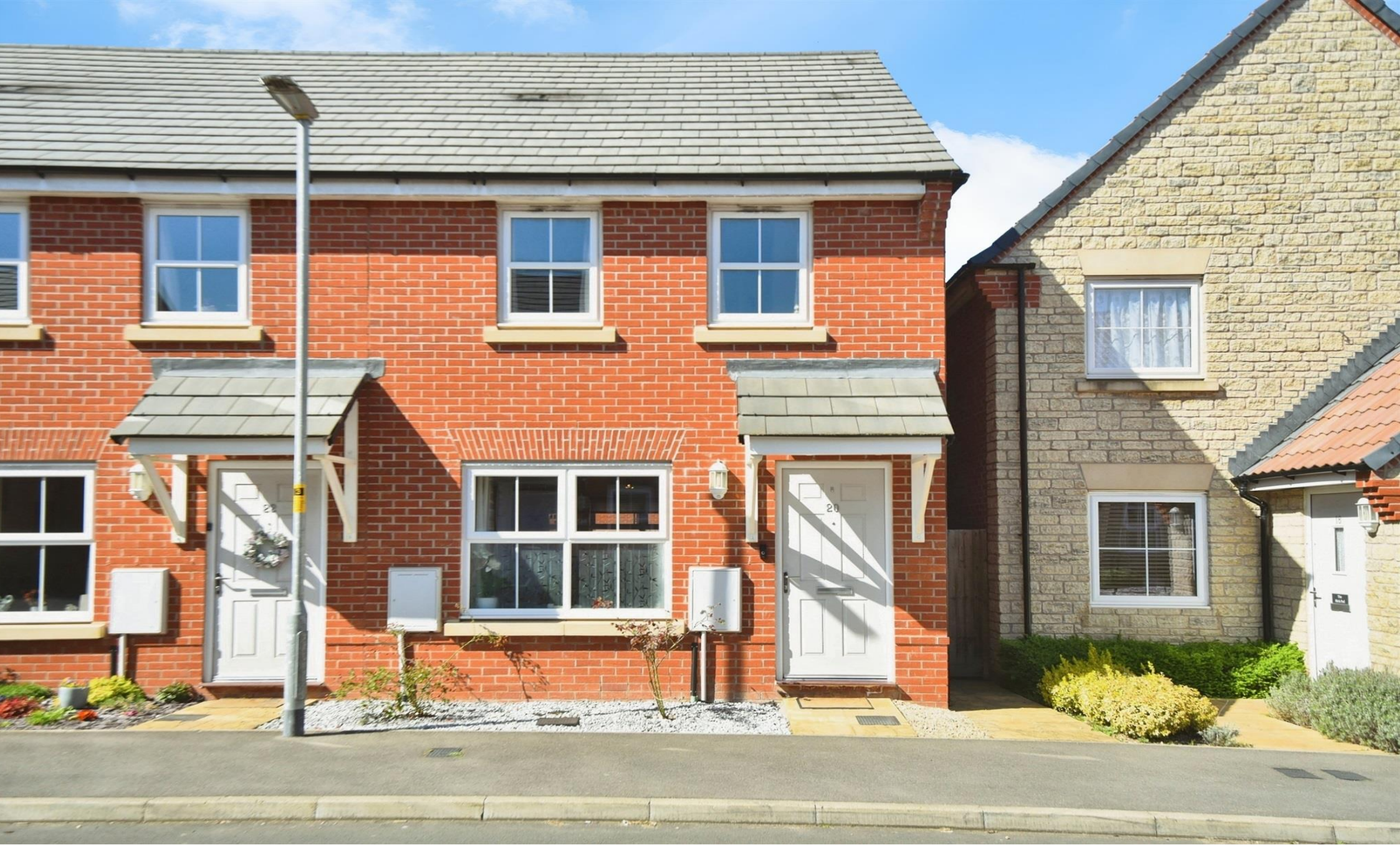
Weston Close, Calne SN11 8GY