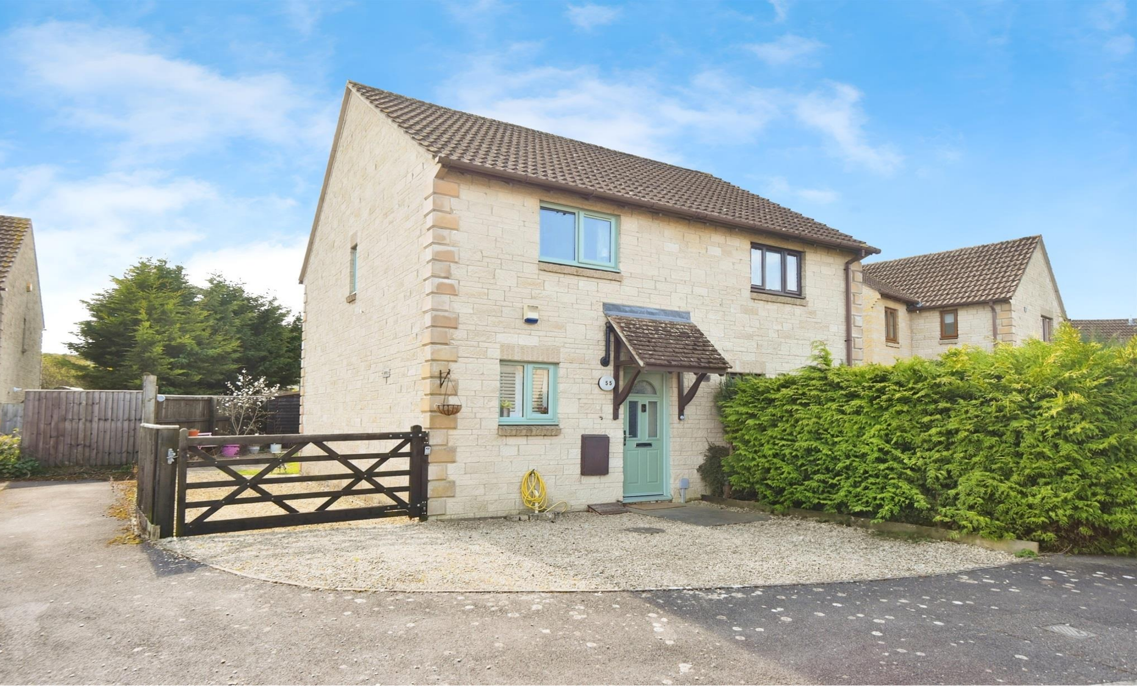
Magnolia Rise, Calne SN11 0QL