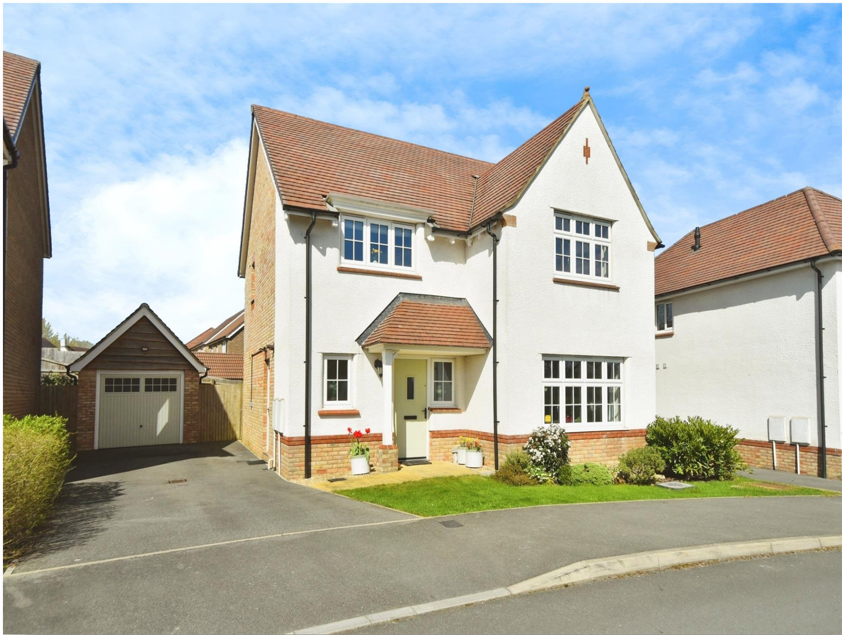
Monument View, Calne SN11 0FR