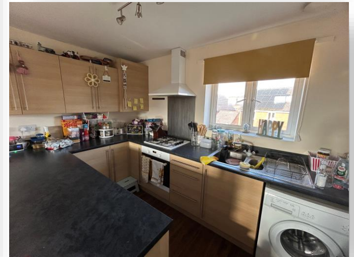
Anson Avenue, Calne SN11 8FU