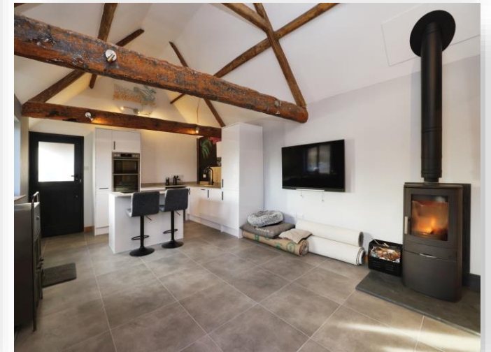
Bridge Cottage Quemerford, Calne SN11 8UJ