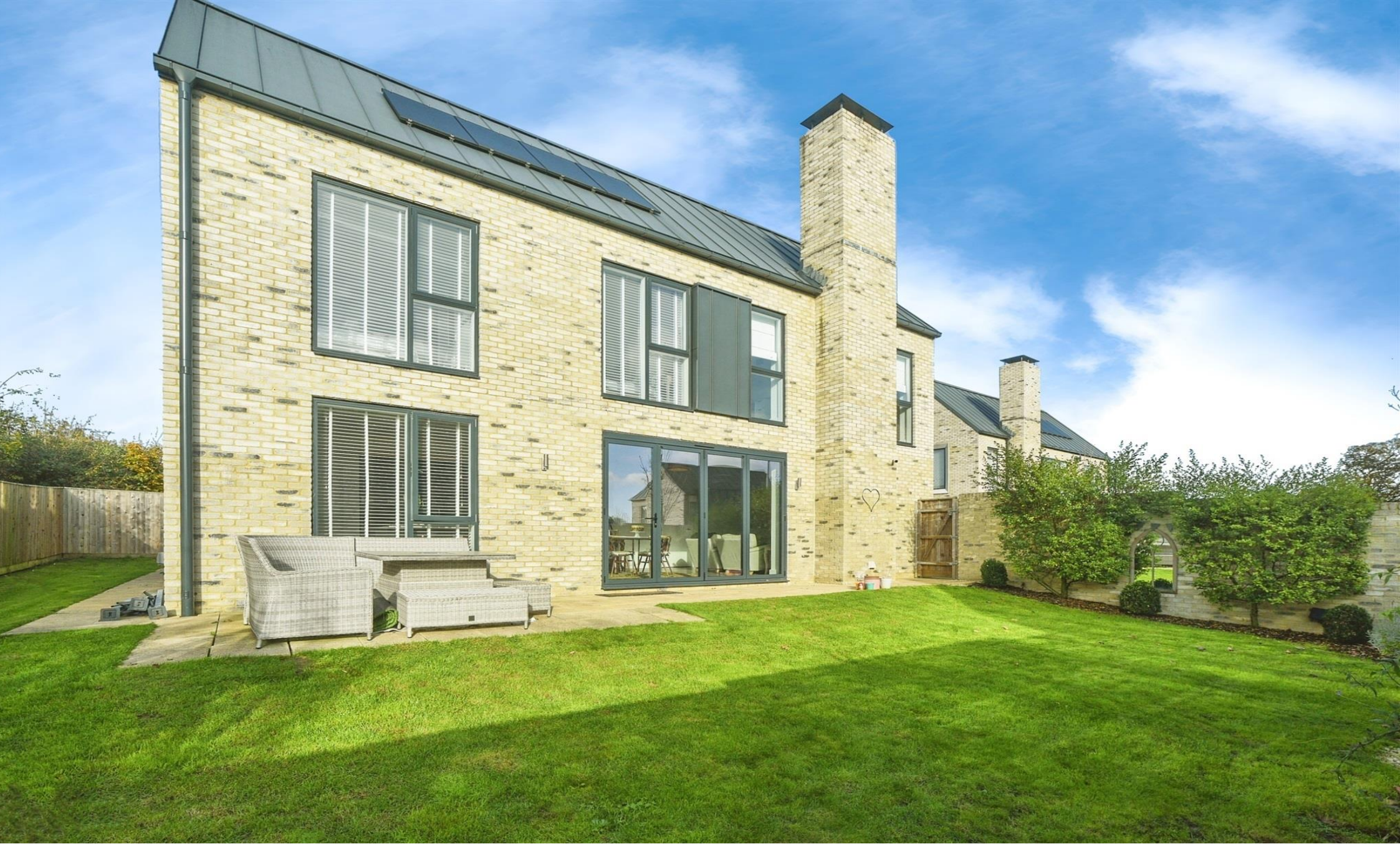
Ceres Place, Calne SN11 8JD