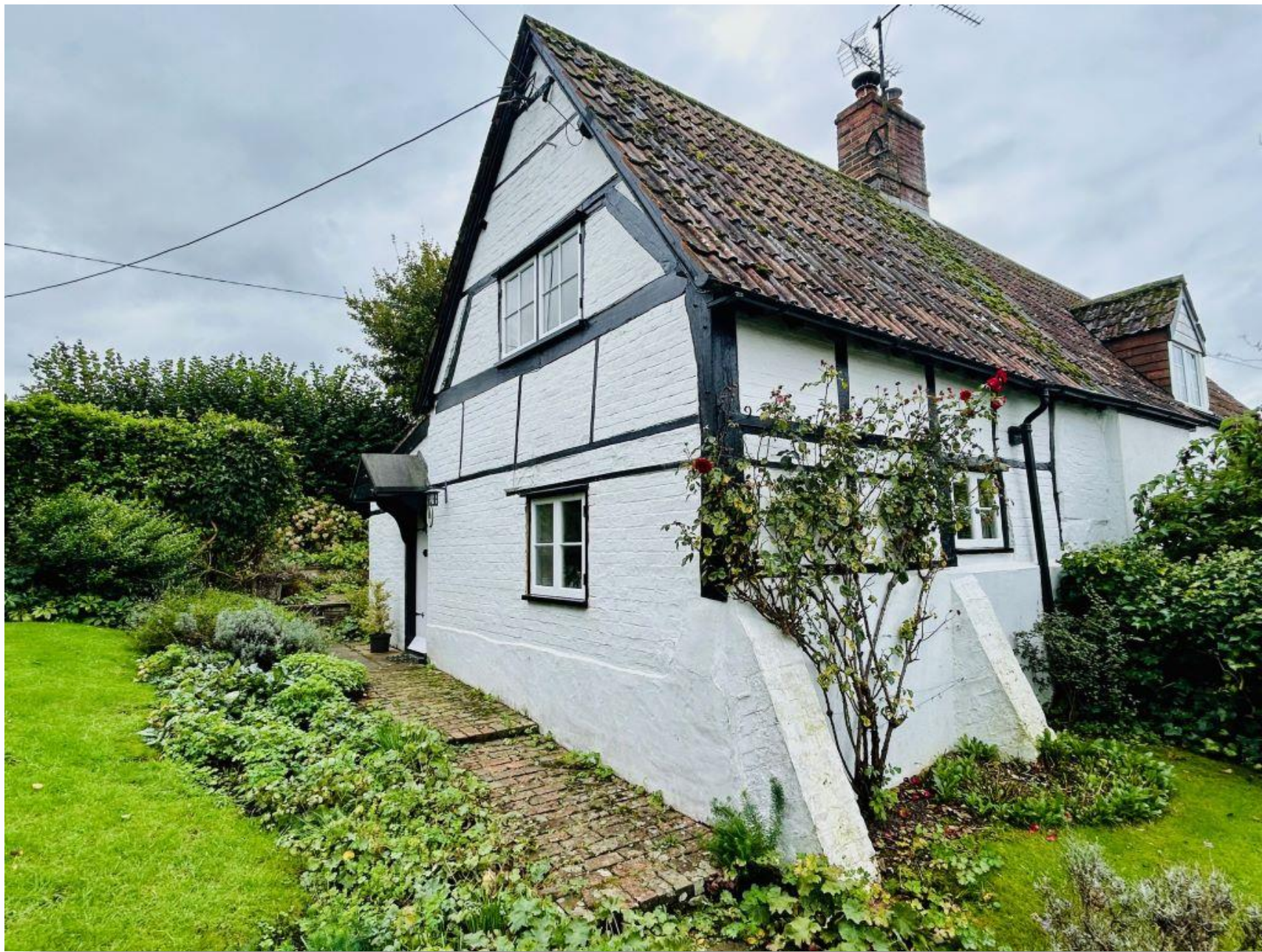
Fir Tree Cottage Heddington, Heddington CALNE SN11 0PF