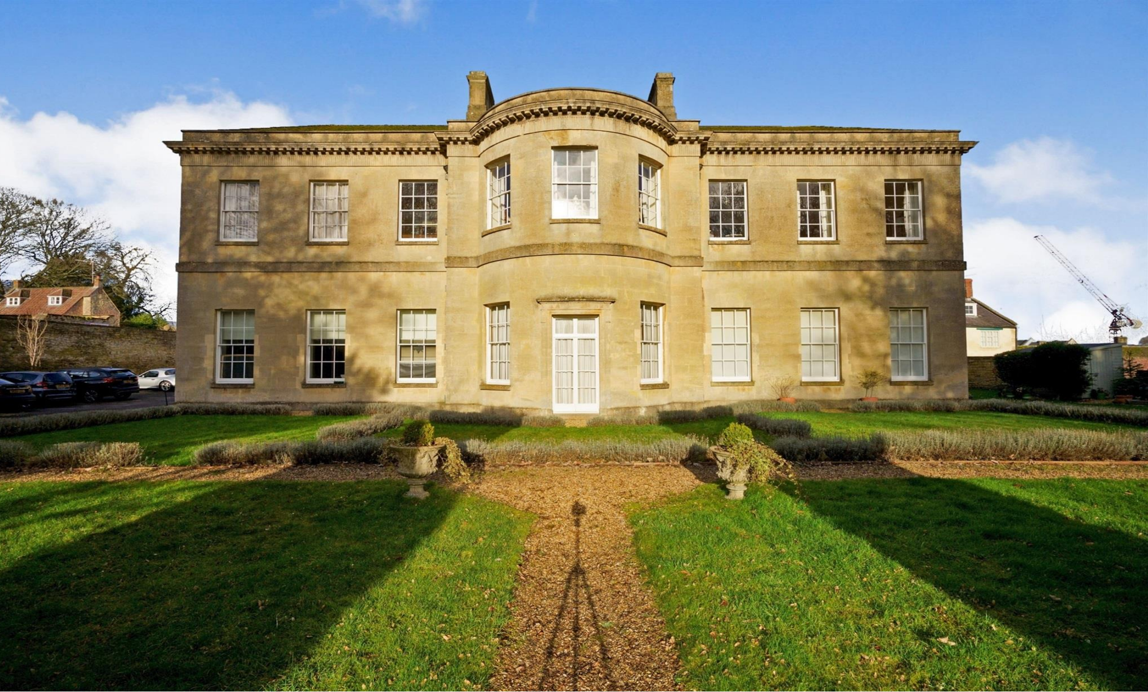
Castle House Castle Street, Calne SN11 0EY