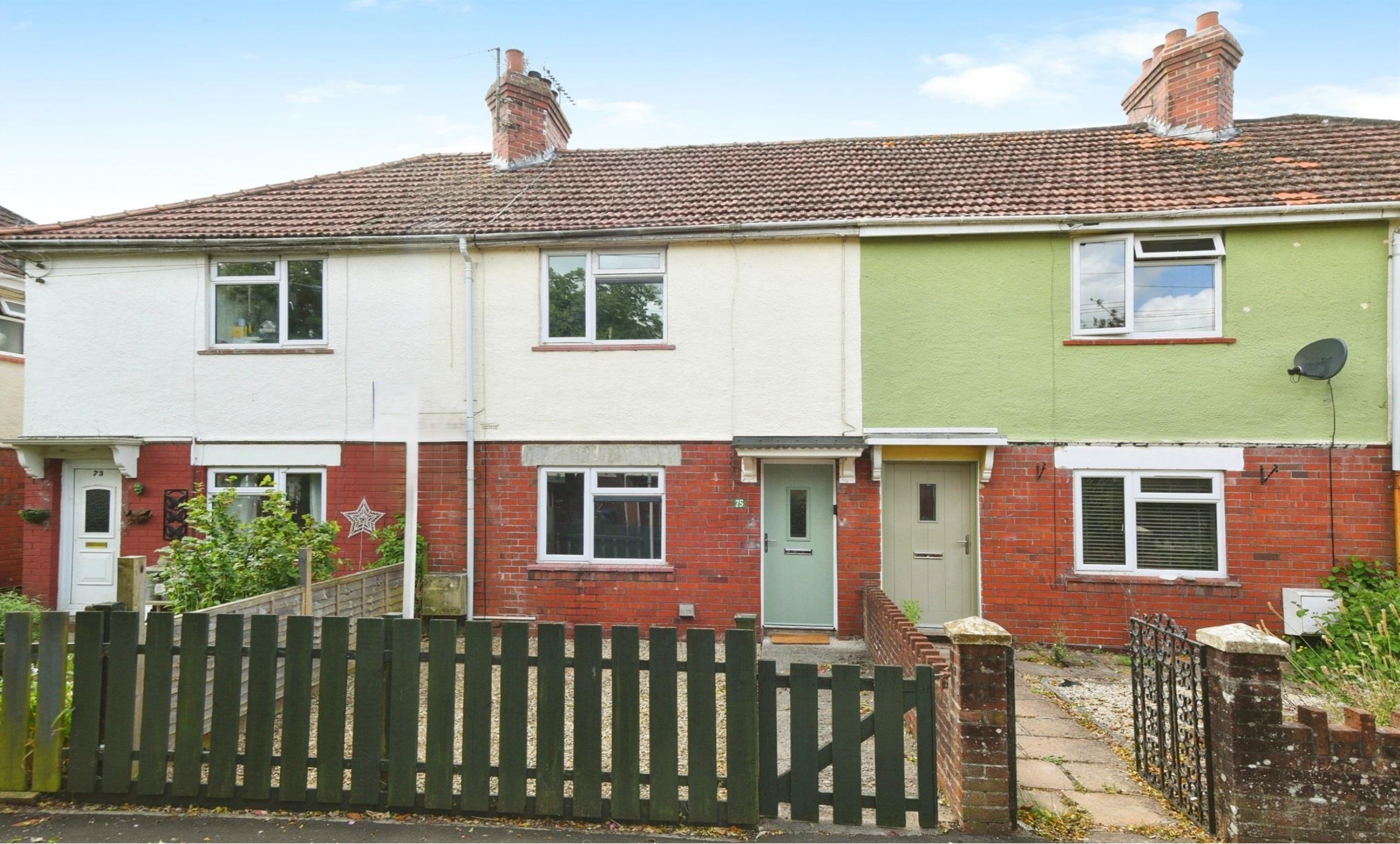
North End, Calne SN11 9DJ