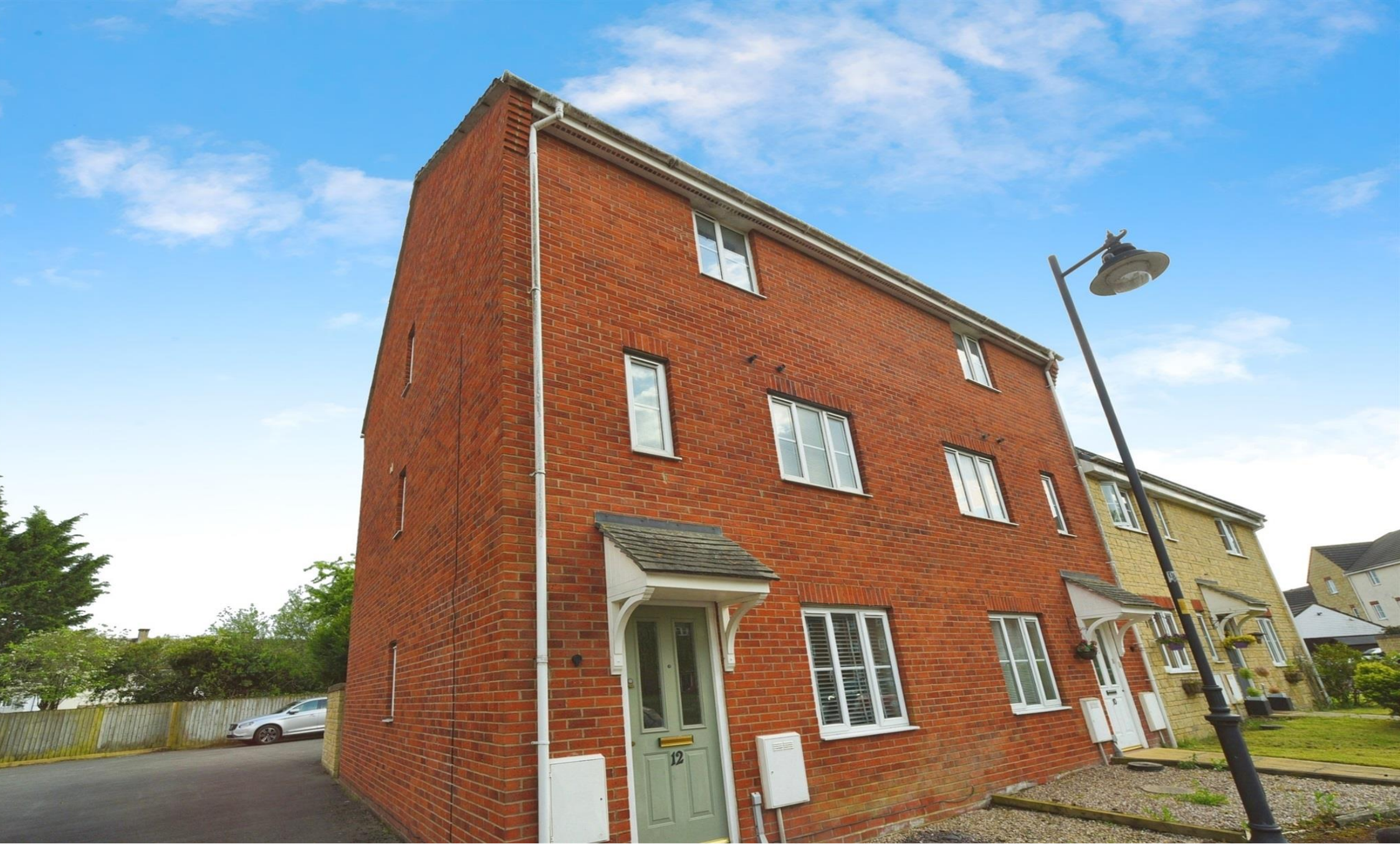
Grayling Close, Calne SN11 9QT