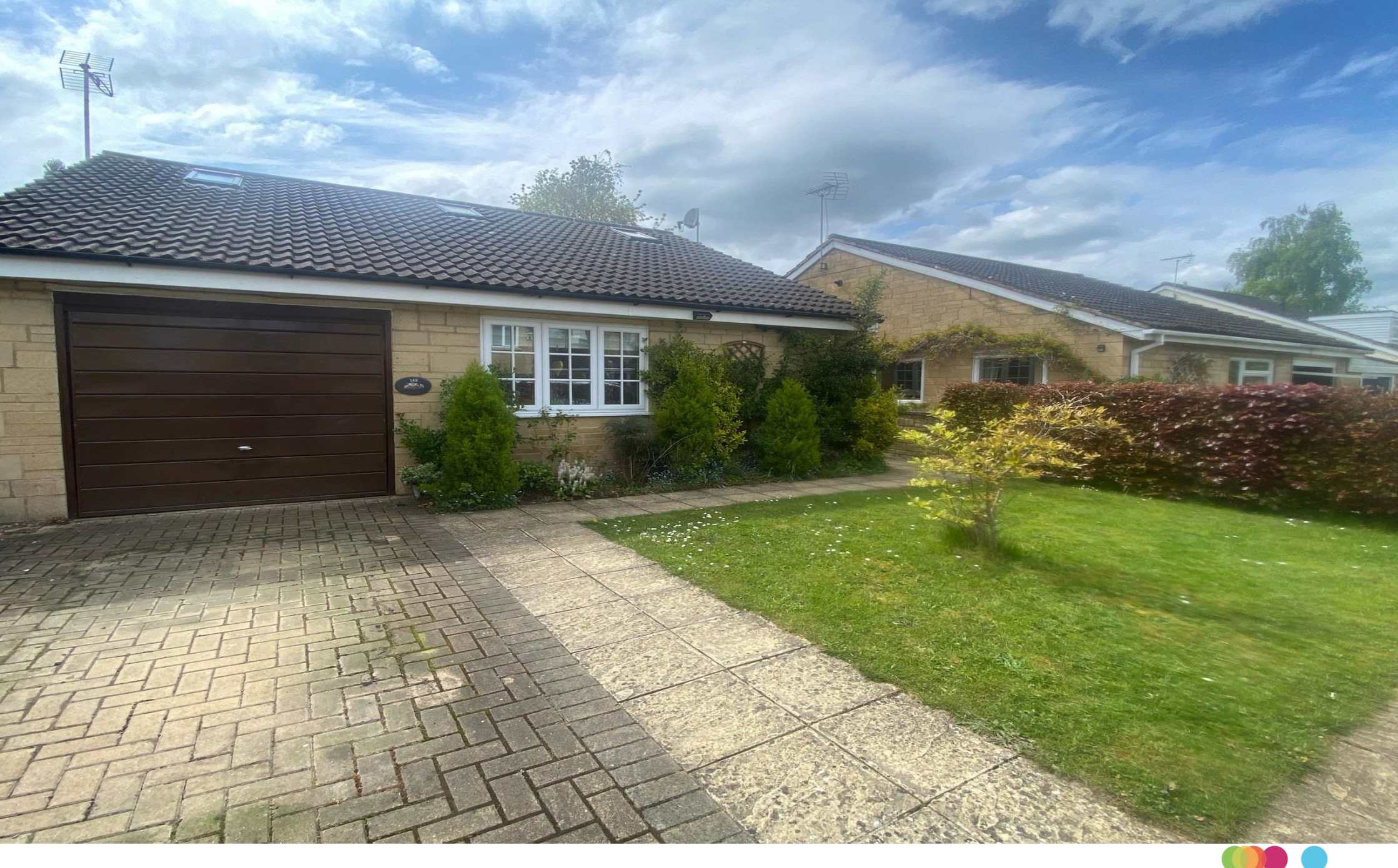
Lansdowne Crescent, Derry Hill Calne SN11 9NU