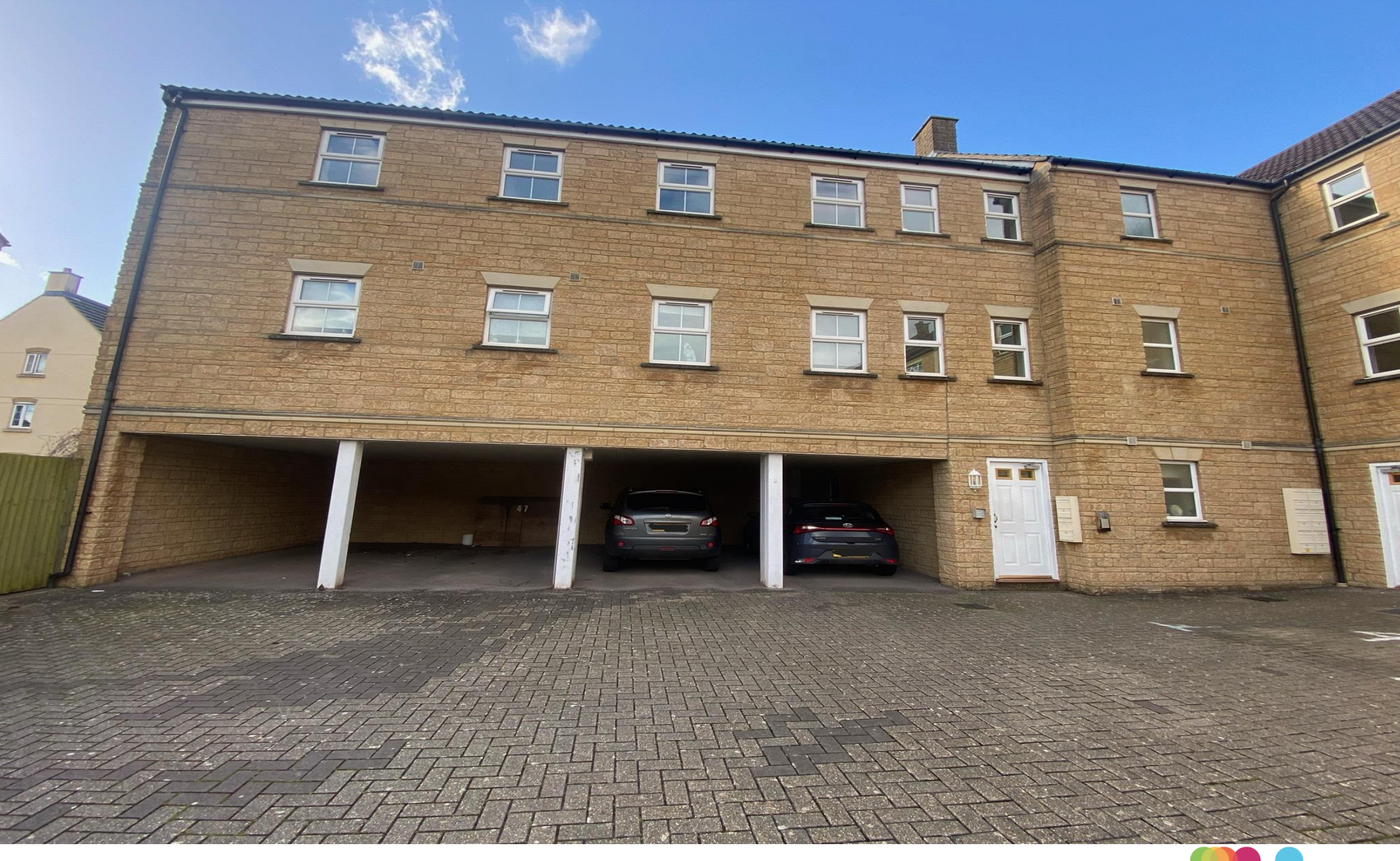
Grouse Road, CALNE SN11 9SF