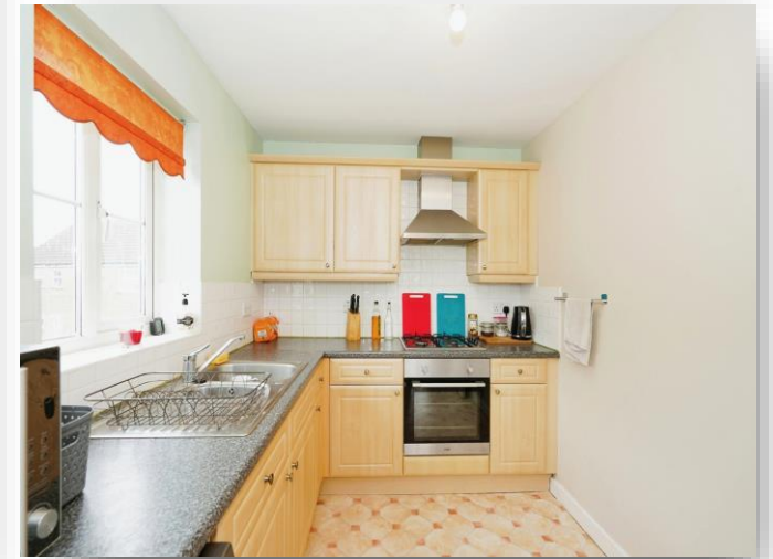
Buzzard Road, Calne SN11 9RU