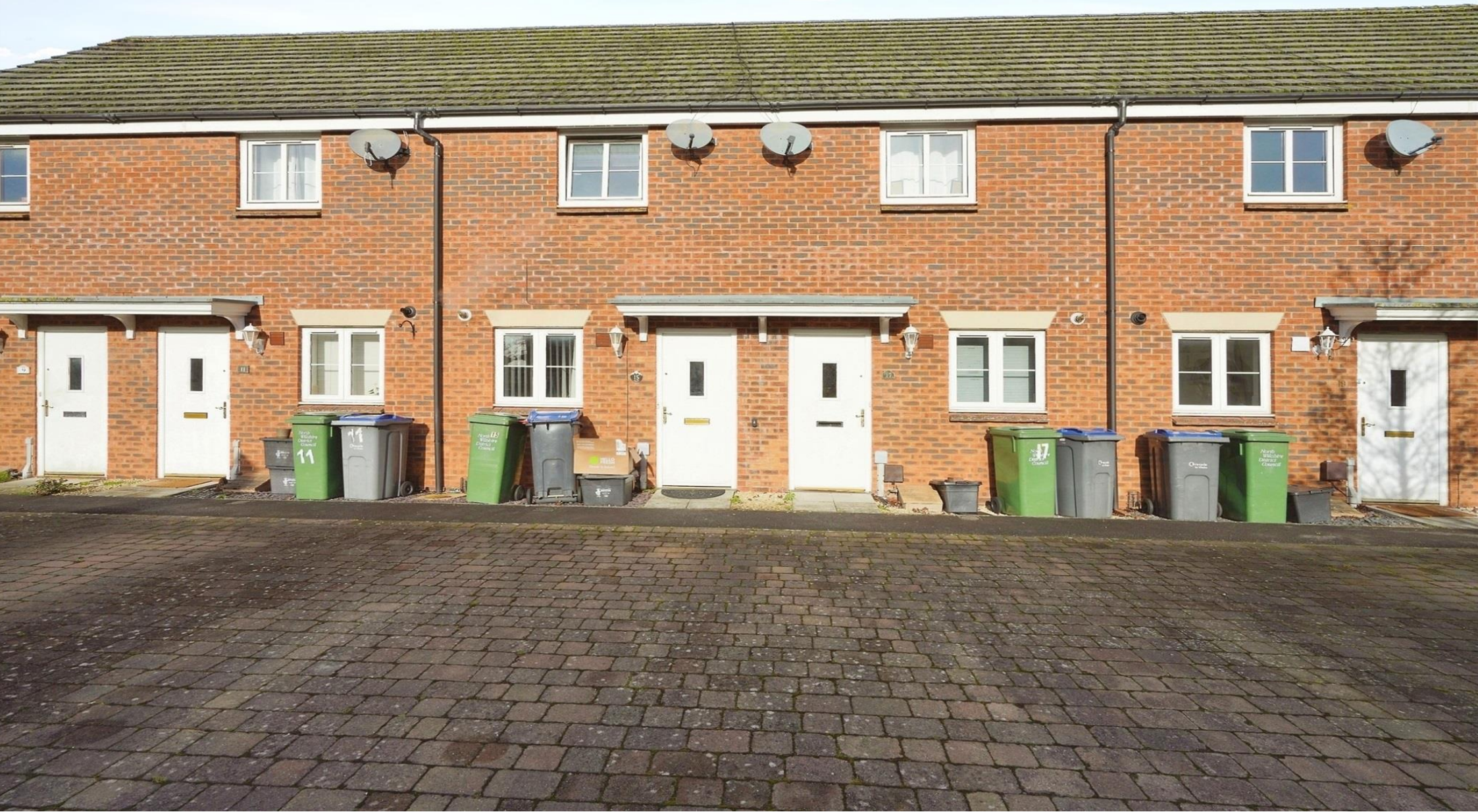
Peregrine Court, Calne SN11 9RY