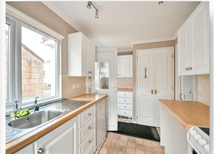
Lillybrook Estate, Lyneham, Chippenham SN15 4AA