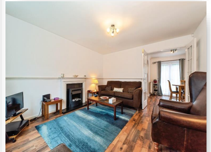
Farme Castle Court, Rutherglen Glasgow G73 1AA