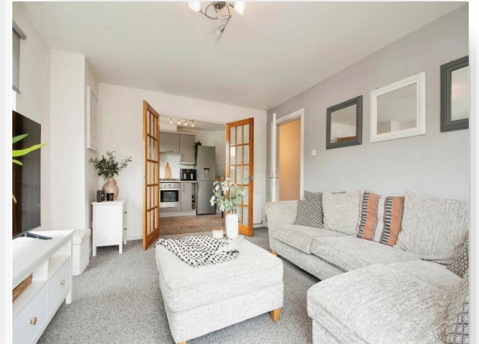
Westfarm Court, Cambuslang Glasgow G72 7TU