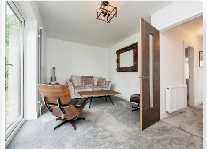
Todhills South, East Kilbride Glasgow G75 0LE