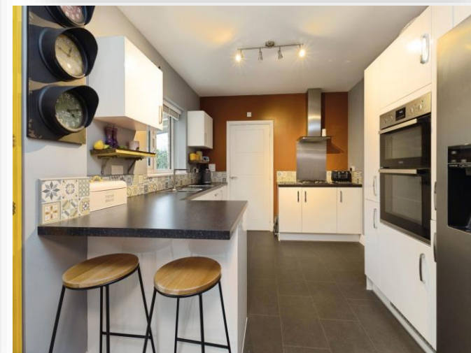
Gold Court, Middlesbrough TS4 2WD