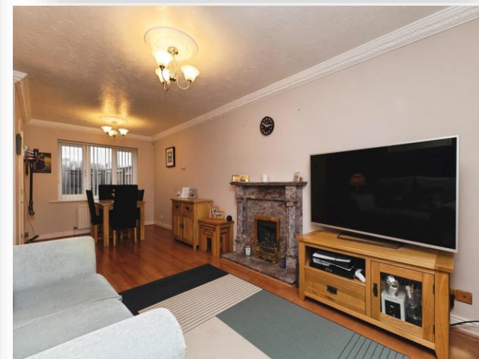
Coulby Manor Farm, Coulby Newham, Middlesbrough TS8 0RY