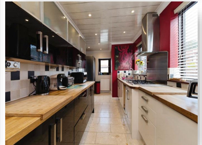
Church Lane, Middlesbrough TS5 7DX