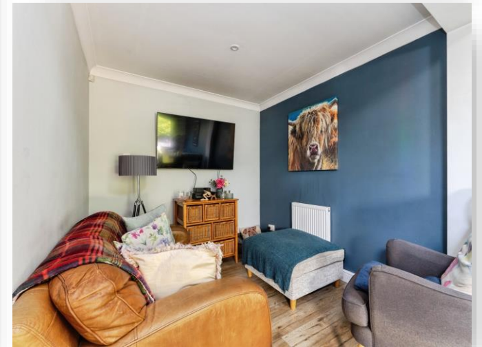
Blairgowrie, Marton-In-Cleveland Middlesbrough TS8 9XU