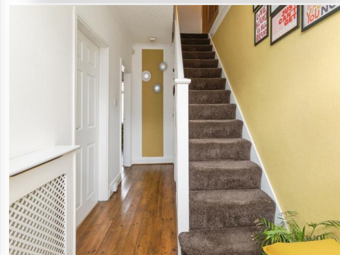
Brompton Road, Middlesbrough TS5 6JU