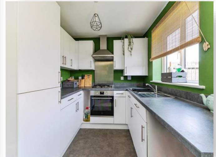
Burdon Avenue, Hemlington Middlesbrough TS8 9GS