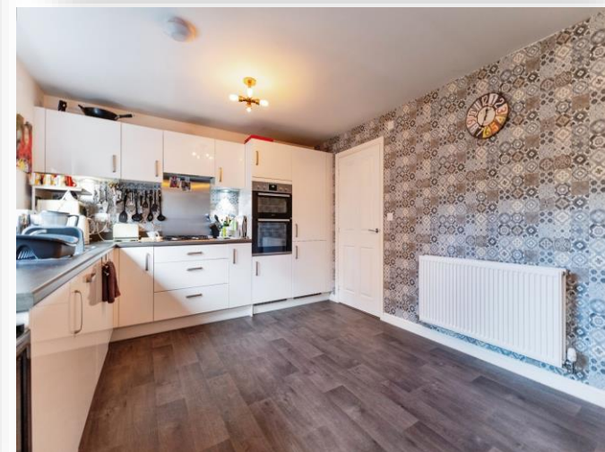
Wolseley Way, Hemlington Middlesbrough TS8 9GP