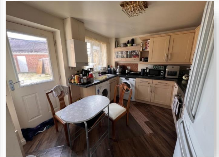
Maddren Way, Middlesbrough TS5 5BD