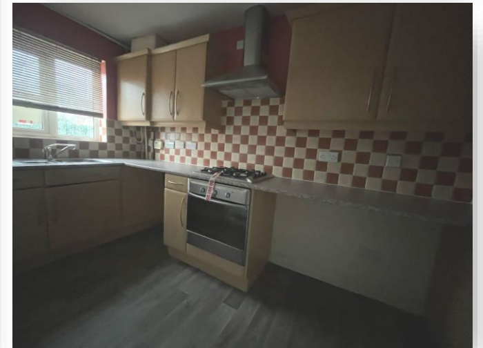
Kirkwood Drive, Redcar TS10 2SX