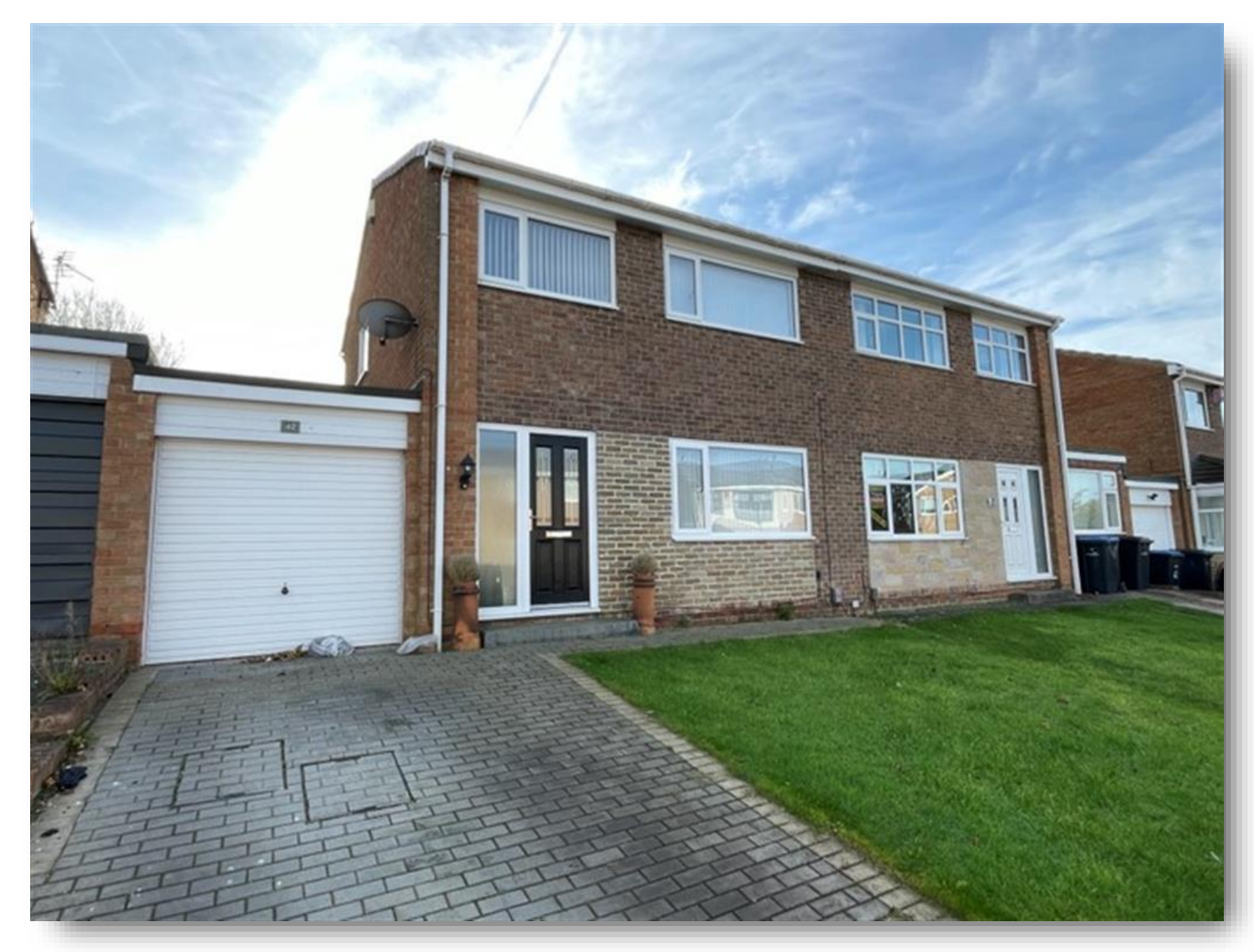
Planetree Court, Middlesbrough TS7 8QT