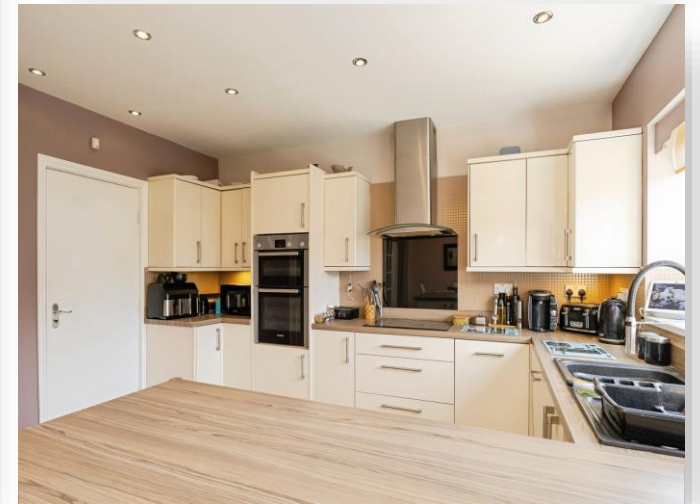
Planetree Court, Middlesbrough TS7 8QT