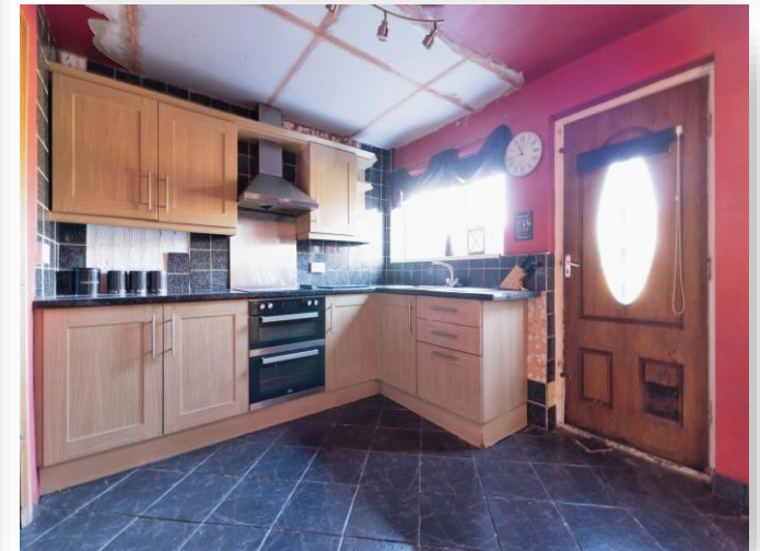
Holdenby Drive, Middlesbrough TS3 0BA