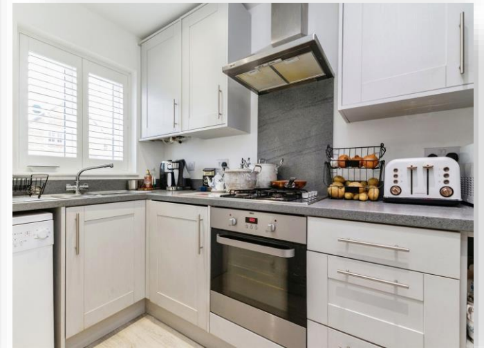
Cochrane Gardens, Redcar TS10 2QA