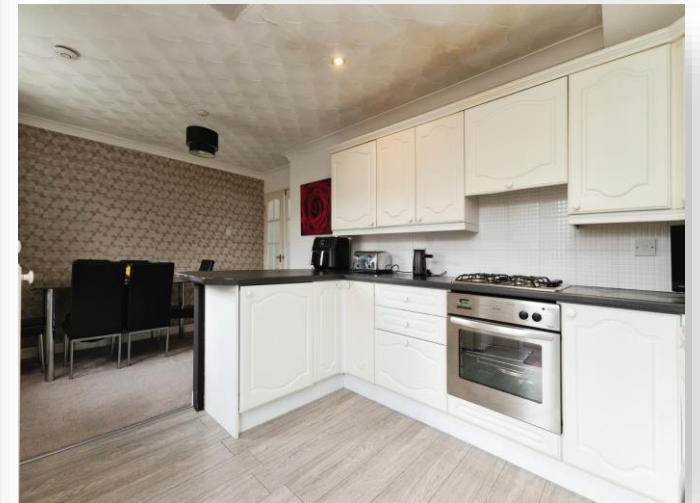
Roseberry Road, Middlesbrough TS4 2QL