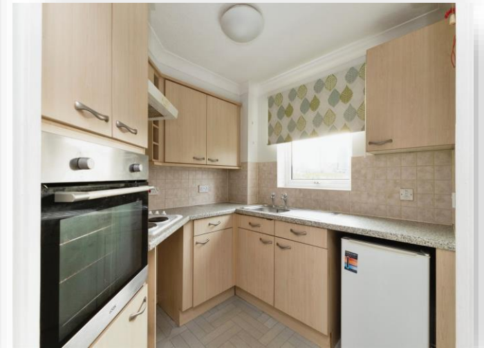
Constantine Court Linthorpe Road, Middlesbrough TS1 3GA