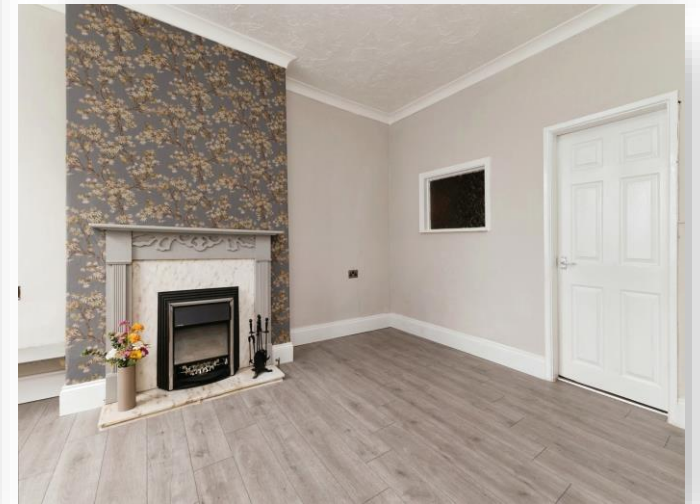
South View Terrace ,Middlesbrough TS3 6PT