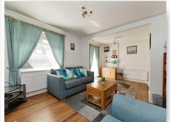
Darenth Crescent, Middlesbrough TS3 7JZ