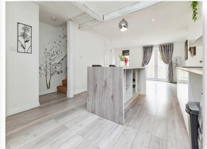
The Covert, Coulby Newham Middlesbrough TS8 0WN