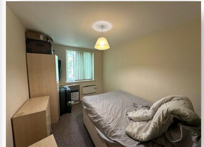
13 Lytton House Lytton Street, Middlesbrough TS4 2BP