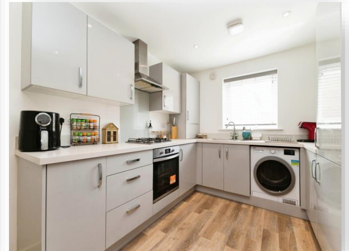
Jacob Drive, Middlesbrough TS4 3AY