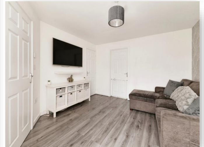
Buckthorn Grove, Middlesbrough, TS8 9BF