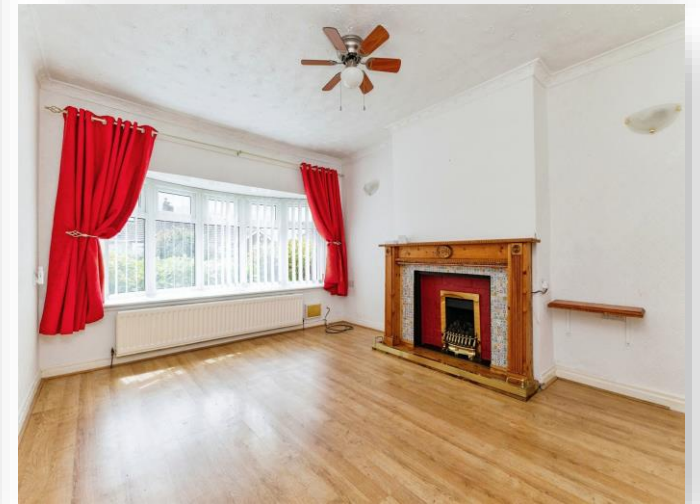
Winston Drive, Middlesbrough, TS6 9LX