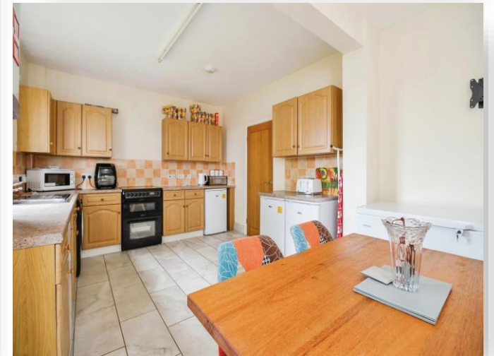
Laburnum Grove, Middlesbrough, TS2 1SU