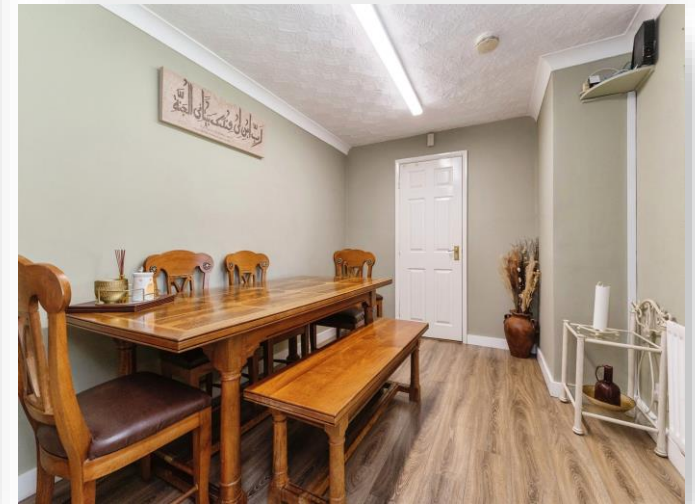
Clevegate, Nunthorpe, Middlesbrough, TS7 0LN