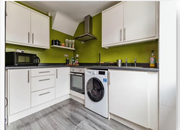
Deighton Road, Middlesbrough, TS4 3QR