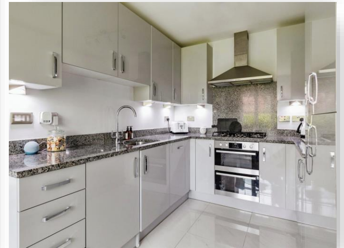
Stein Grove, Middlesbrough, TS5 8DJ