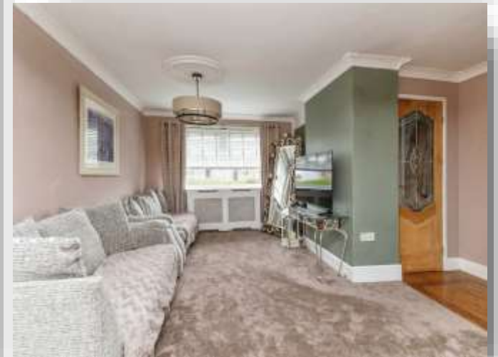
Fulbeck Road, Middlesbrough TS3 0RW