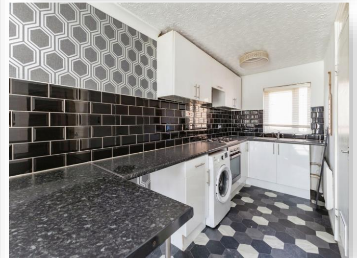
Melton Walk, Hemlington Middlesbrough TS8 9NB